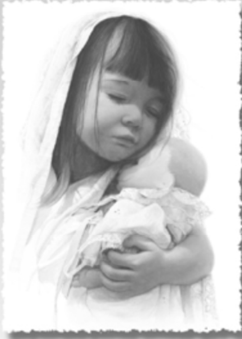
ACTUAL COLOR PRINT SIZE: 14" X 16"

Free Y2000 large format wall calendar when you order Hope. This beautiful calendar features Hope on the cover. Inside are the drawings and paintings of Mitchell Tolle. A $12.95 value.